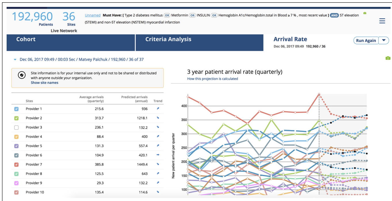
Fig 3. Arrival rate graph representation on the basis of the historical data analyses for each health care organization.

the research results. 24 Although the adoption of EHRs has exploded as a result of federal incentives and meaningful use requirements, the quality of the data contained in EHRs and, correspondingly, that used in research is slowly improving. Many EHRs were designed and operate with billing and patient care functions in mind, which limits the quality of data for research purposes. 16 Such potential limitations in observational data warrant a comprehensive data-quality framework and approach. 25 There is limited literature on the topic of data quality, and the majority of work described has focused on assessing the quality of data in a single system or a single institution, as expected. 26 Furthermore, efforts to quantify the goodness of data typically focus on whether the data are good enough for the primary purpose, which is providing clinical care to patients.